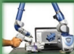
FARO Edge ScanArm